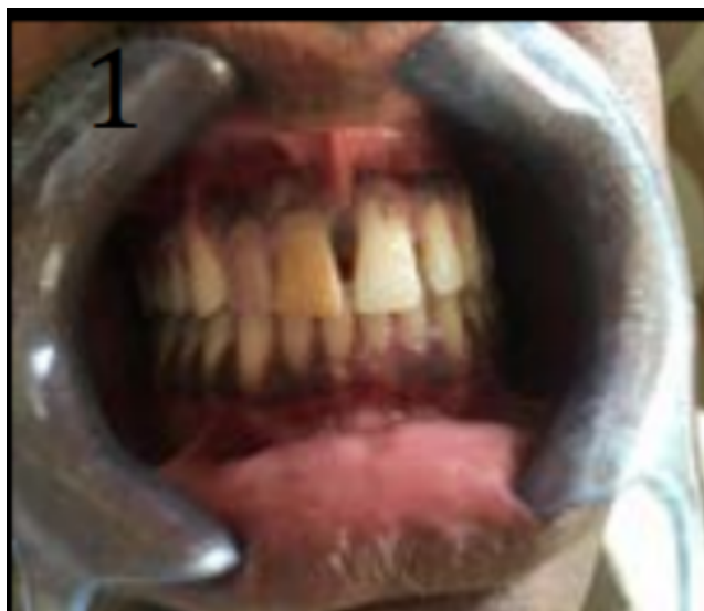
Figure-1: Pre-operative Clinical picture

The pulp vitality tests irt 12 revealed that the tooth was nonvital while the radiographic examination of the concerned area in the form of an intra-oral peri-apical radiograph (IOPAR) revealed that it had a large peri-apical radiolucency.