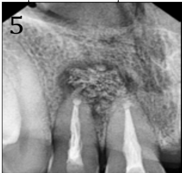
Figure 5: 1 month follow up Radiograph