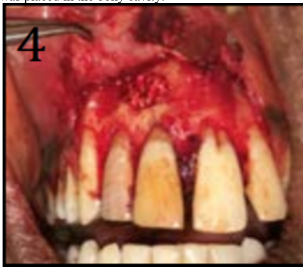
Figure: 4 Placement of Bone Graft in the Bony socket The Flap was then sutured back in position.

After Laser Biostimulation, Hydroxyapatite bone graft was placed in the bony cavity.