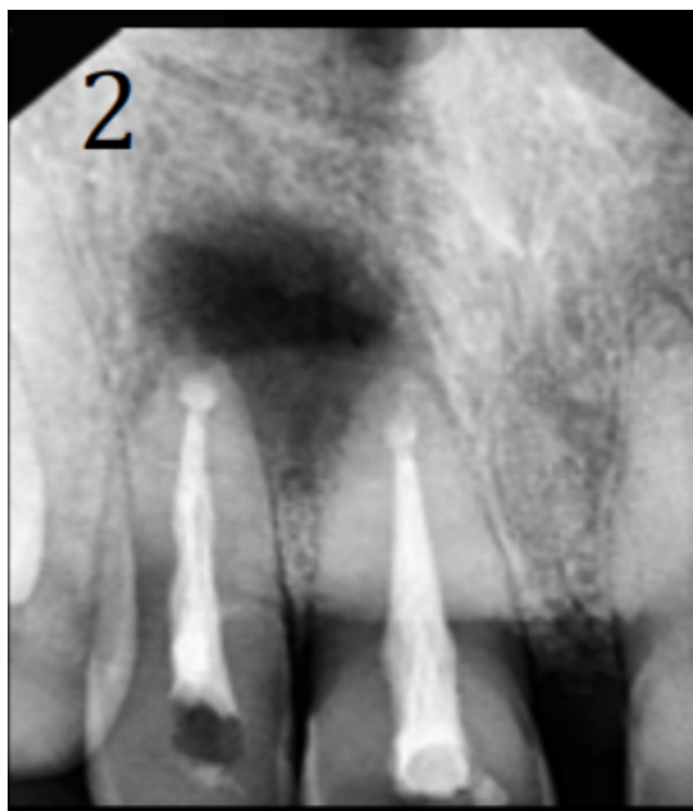
Figure: 2 Preoperative Radiographs

The pulp vitality tests irt 12 revealed that the tooth was nonvital while the radiographic examination of the concerned area in the form of an intra-oral peri-apical radiograph (IOPAR) revealed that it had a large peri-apical radiolucency.