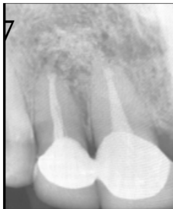
Figure 7: 1 year follow up Radiograph

CBCT Scan was taken immediately after the surgery for the measurement of the bone defect