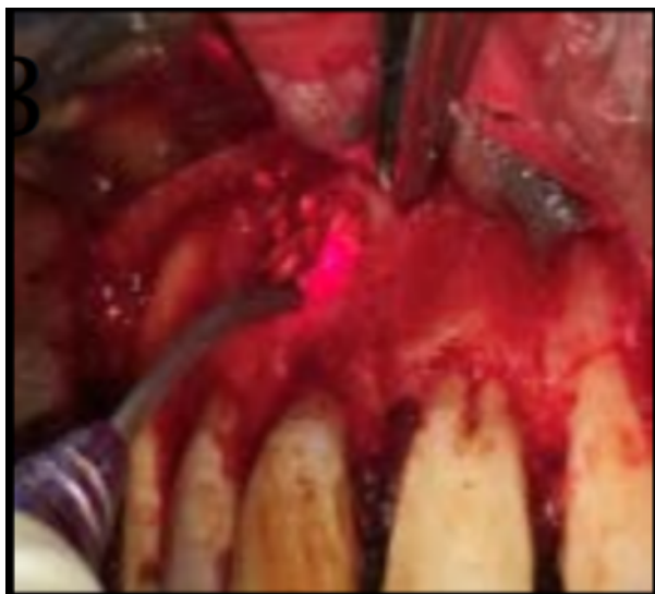
Figure:3 Laser Biostimulation

After Laser Biostimulation, Hydroxyapatite bone graft was placed in the bony cavity.