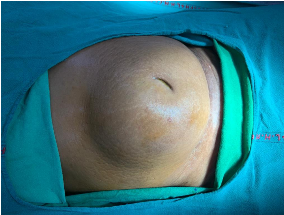
Image 1- Preoperative