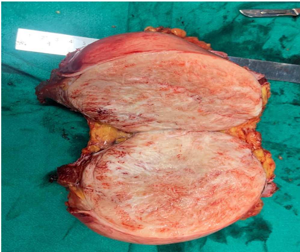
Image 4- Specimen