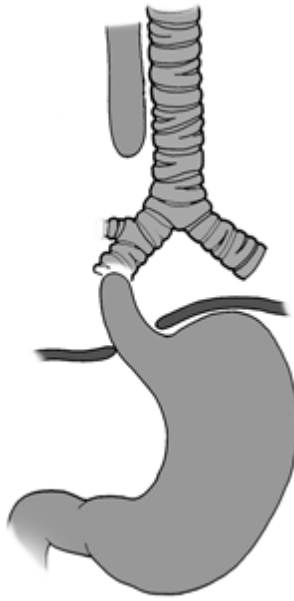
Figure 2: Esophageal atresia Type A without Tracheoesophageal fistula

An abdominal ultrasound was normal. Pediatric surgery team was consulted, and an open esophagostomy with gastrostomy was done. Few days later, after a trial of feeding per gastrostomy, the baby's condition deteriorated. She developed a sero-sanguinous secretion from the gastrostomy. The abdomen was tense, the skin was mottled, and a respiratory support was needed. After stabilization, an urgent abdominal x-ray was done showing minimal gas distribution in the digestive tract with abundant gas in the abdomen suggestive of pneumoperitoneum (football sign) as shown in figure 3. A perforation was suspected.