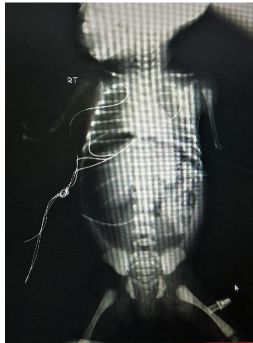
Figure 3: KUB showing pneumoperitoneum

An abdominal ultrasound was normal. Pediatric surgery team was consulted, and an open esophagostomy with gastrostomy was done. Few days later, after a trial of feeding per gastrostomy, the baby's condition deteriorated. She developed a sero-sanguinous secretion from the gastrostomy. The abdomen was tense, the skin was mottled, and a respiratory support was needed. After stabilization, an urgent abdominal x-ray was done showing minimal gas distribution in the digestive tract with abundant gas in the abdomen suggestive of pneumoperitoneum (football sign) as shown in figure 3. A perforation was suspected.